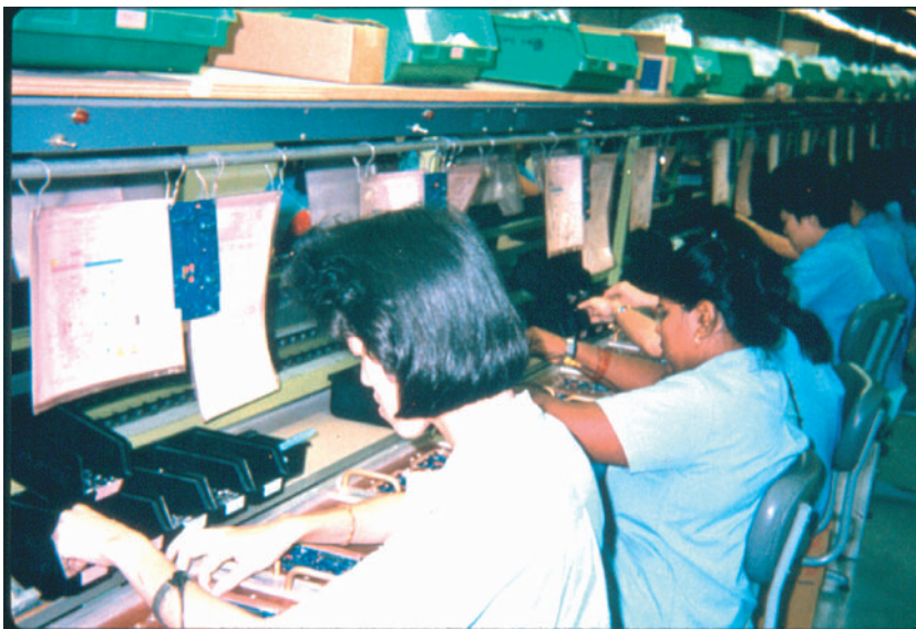
Figure 1 The majority of electronics assembly line workers are female.