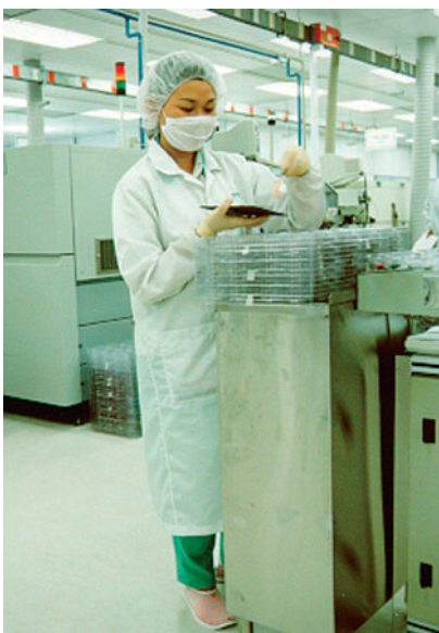
Figure 2 Typical attire of a clean room operator (the protective clothing is to protect the work materials and final product).

Executive in 1998 at a semiconductor plant in Scotland suggested that cancer incidence (especially lung cancer) of its workers was higher than that of the general population (McElvenny et al , 2001).